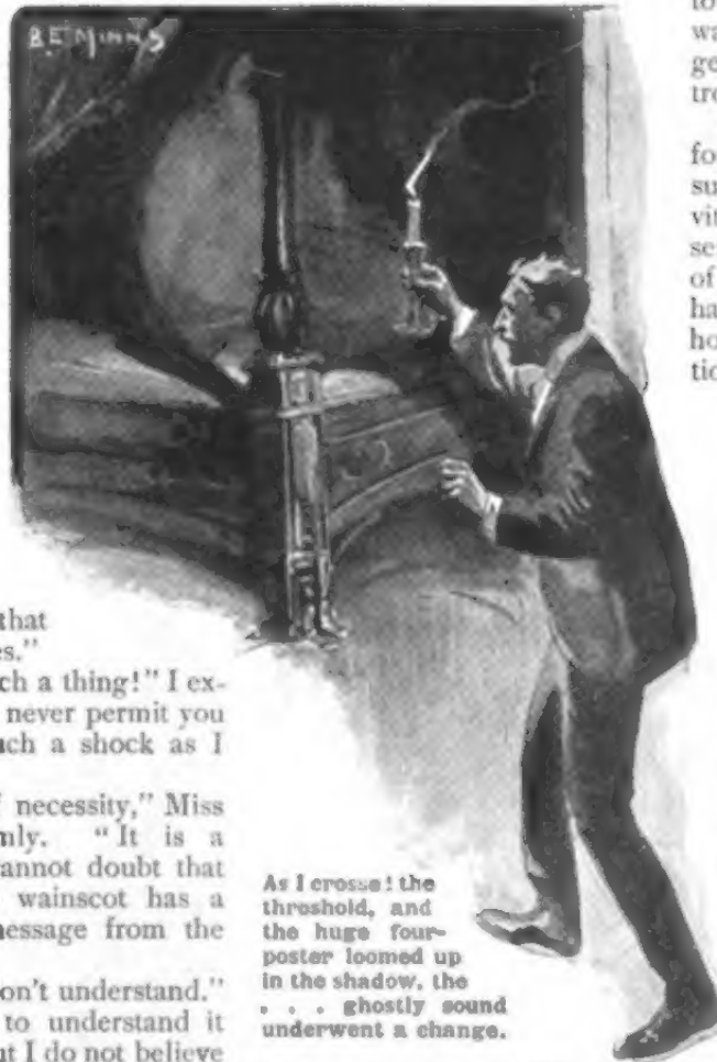
As I crossed the threshold, and the huge four-poster loomed up in the shadow, the . . . ghostly sound underwent a change.

"It may be that Mrs. Musgrave is right," she said thoughtfully. "Very often the spirits